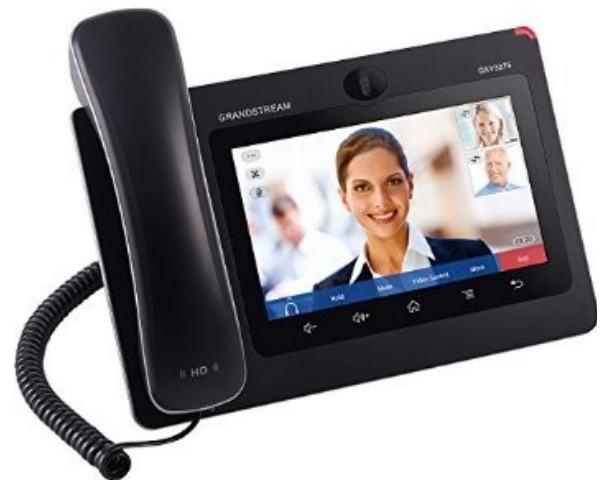
VOIP Video Enabled Telephones